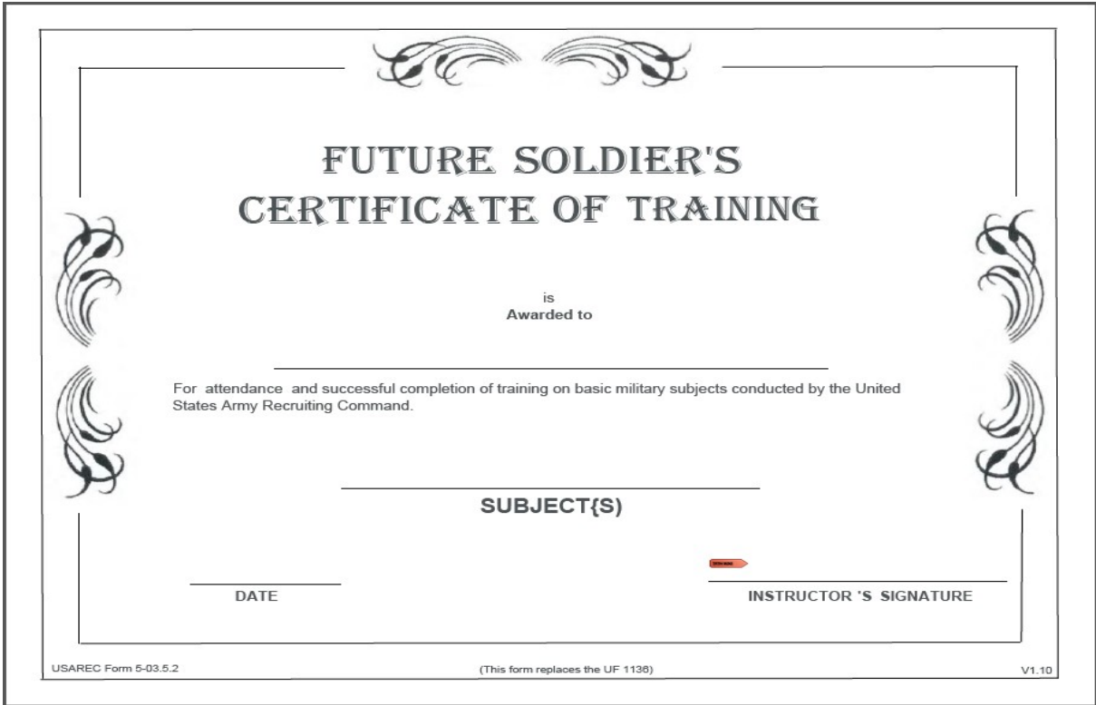
Figure C-2. Example UF 5-03.5.2- Future Soldier Certificate of Training