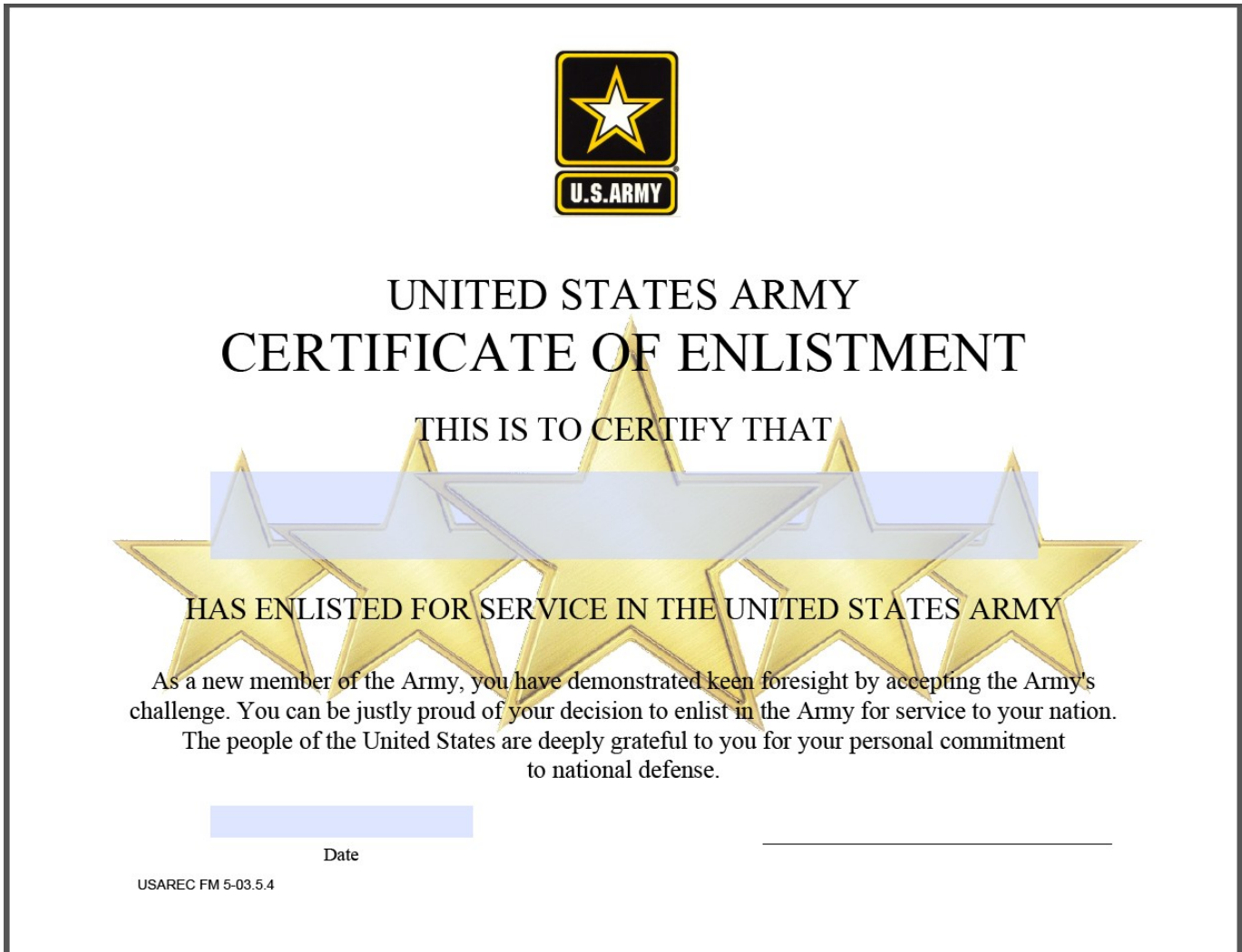
Figure C-4. Example UF 5-03.5.4- Certificate of Enlistment

C.2 Keep in mind when presenting these certificates that these are the first certificates of the Future Soldiers career. Present them in a way the Future Soldier and family members will remember and want to display for years. This means that the certificates should be printed in color on marbled or colored cardstock paper. If you do not have these capabilities, utilize your company or battalion to develop a system to generate certificates worthy of presentation. The UF 589 (old Certificate of Enlistment) may be used until inventory is exhausted by submitting a DA Form 17 to the command Pubs office at: usarmy.knox.usarec.mbx.g6-publications@mail.mil .