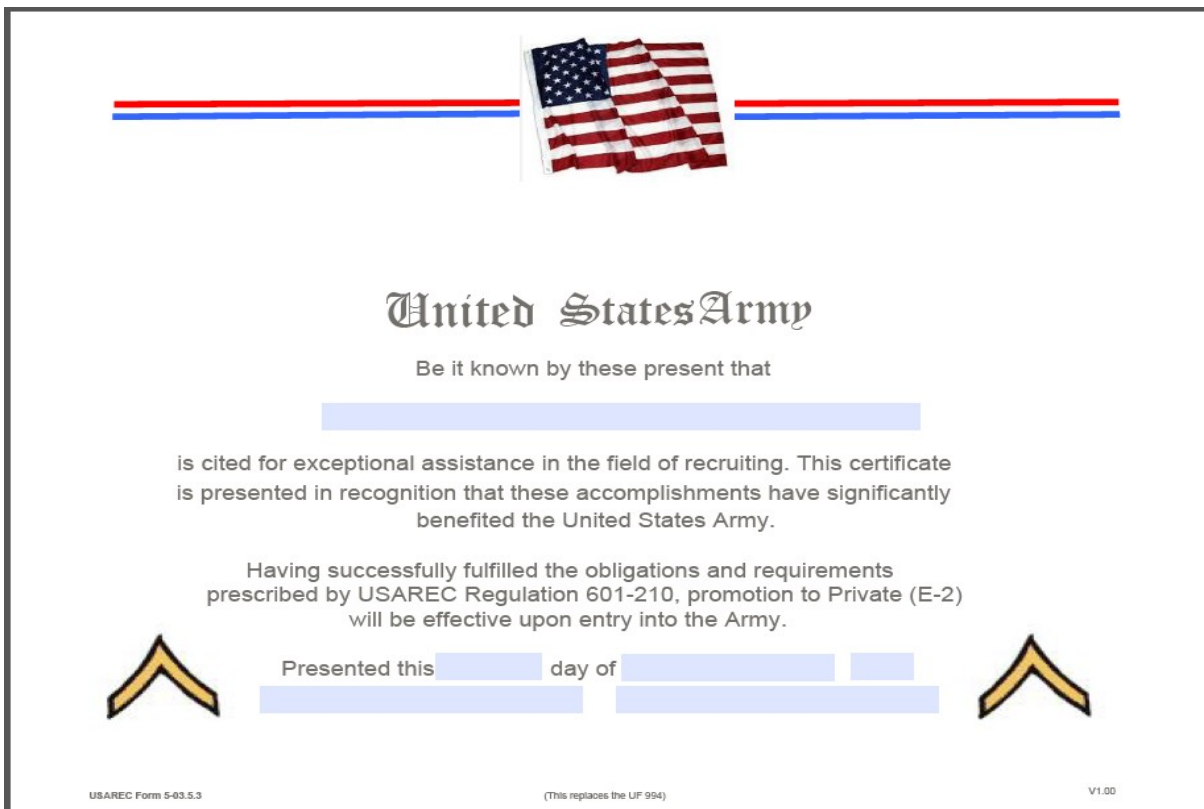
Figure C-3. Example UF 5-03.5.3- Future Soldier Referral Promotion Certificate