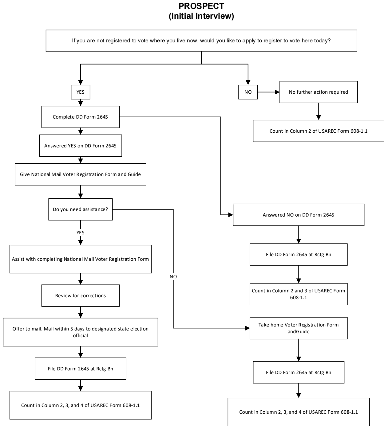
Figure 4-2 Sample prospect flow chart